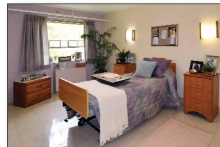
A room on Alden Long Grove's new Extended Care Unit.

After touring the unit, guests at the Open House were treated to refreshments, mini-massages and a 'De-Stress Yourself' lecture.